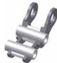
TIPO B - A RULLI

CATENA PRODOTTA DA AZIENDA CERTIFICATA ISO 9001 - ISO 14001 E API 7F CHAIN PRODUCED BY ISO 9001 - ISO 14001 AND API 7F CERTIFIED COMPANY