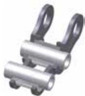
TIPO A - A BUSSOLA